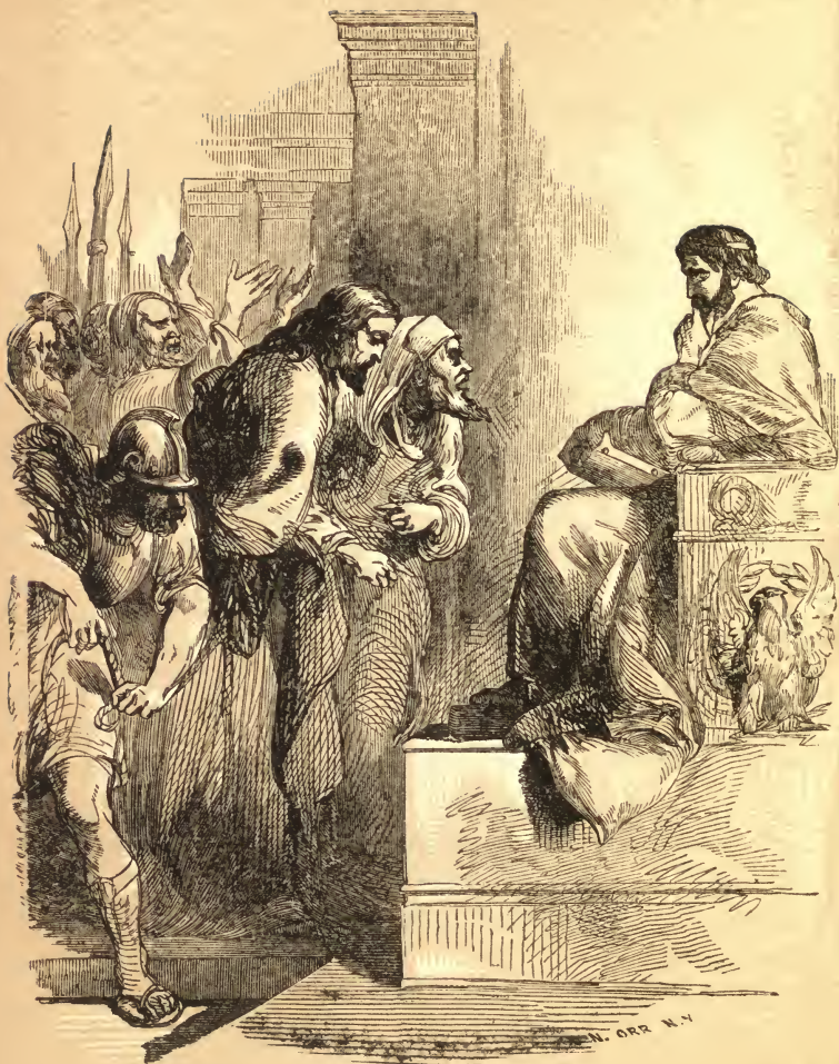
JESUS BROUGHT BEFORE PILATE.